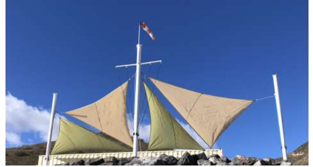
New Shade Sails - A Welcoming Sight.