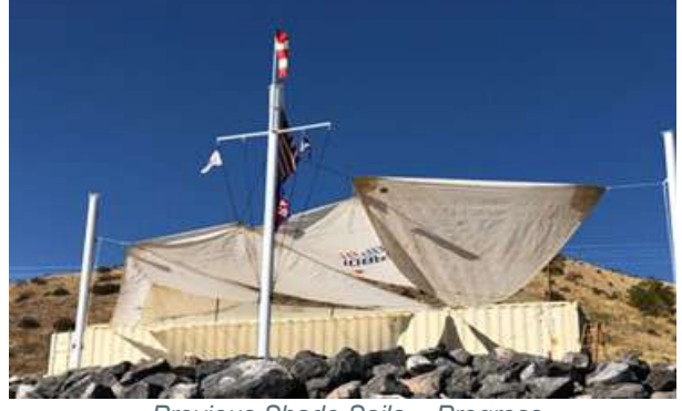
Previous Shade Sails - Progress

The SISO Sailing Center provides the opportunity to learn in the great outdoors. The outdoor classroom enjoys the cool mornings which can be refreshing and may require youth sailors to wear a jacket to keep warm. However, hot afternoons require shade. Shade becomes a welcome relief from the direct sun.